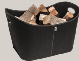
Aduro Baseline firewood basket in PET, black